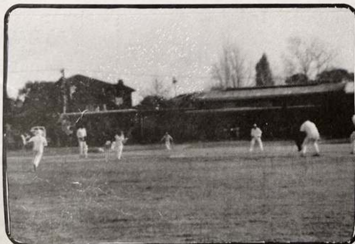
PETERITES TAKE THE FIELD AT THEIR HOME GROUNDS IN MURRUMBEENA IN THE YCW CRICKET COMPETITION. PAVILION (ABOVE) IS SEEN IN THE BACKGROUND.